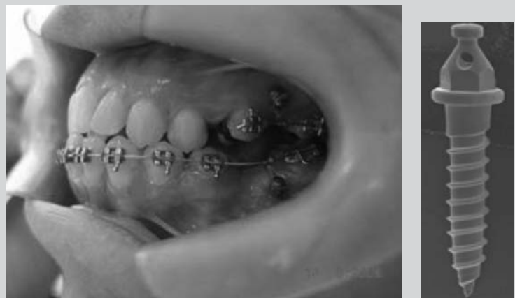
Figure 4. An example of an orthodontic mini-implant for anchorage application.