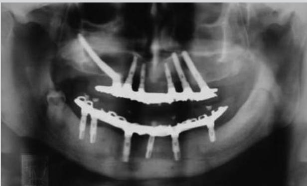
Figure 5. A zygomatic implant.

Morais et al. 4 inserted mini-implant orthodontics in two groups of rabbits. One group was loaded immediately after the surgery and the second group was not loaded during the healing time. When a stress analysis on the mini-implant was carried out, the torque at which cp Ti and Ti-6Al-4V deform plastically and the shear strength of the interface mini-implant-bone was calculated. No increase was observed in the removal torque value between 1 and 4 weeks of healing, regardless of the load. Nevertheless, after 12 weeks, a significant improvement was observed in both groups, with the highest removal torque value for the unloaded group. The stress analysis reveals that the removal torques for cp Ti dangerously approach its yield stress. The results of this rabbit model study indicate that titanium alloy mini-implants can be loaded immediately with no compromise in their stability. The detected concentration of vanadium did not reach toxic levels in the animal model. Consequently, to improve the mini-implant orthodontic for anchorage behavior it is important to