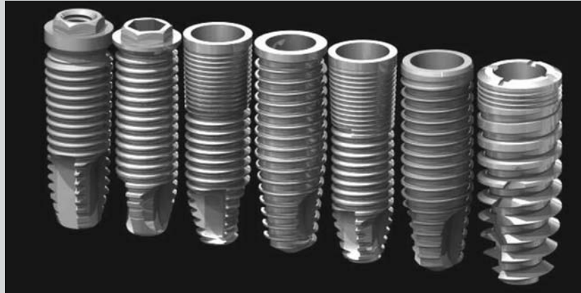
Figure 1. Examples of commercial dental implant designs.

L. Morais et al. 4 analyzed the vanadium ion release during the implant